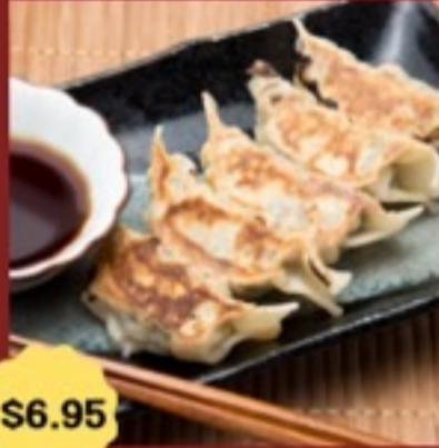
Shrimp pop (4pcs)